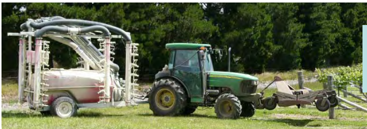
Multi function tractor : 3 Row sprayer & front hitch mowing